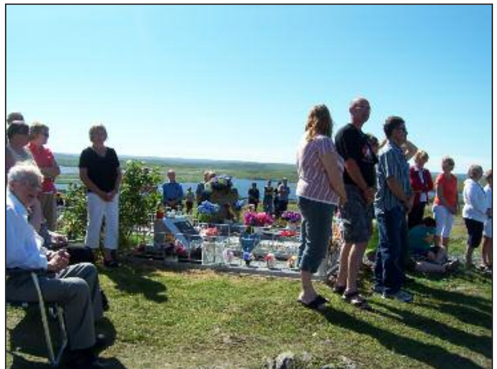
Residents of Portugal Cove South held a cemetery mass in memory of their departed loved ones during Cape Race Days in August.